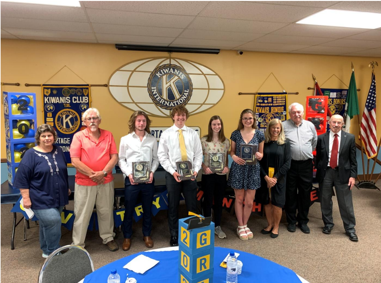
Our scholarship recipients along with the Scholarship Committee.